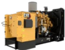
Cat® CG18 DG500