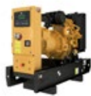
Cat® C2.2 Diesel